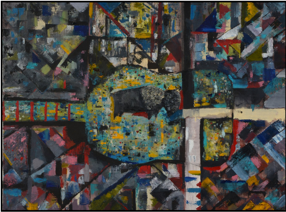
Untitled 1 Oil on canvas © 2017 Tobias Monroe

“My ancestors depended on the buffalo for many aspects of life and for that reason they are my favorite subject to paint.”