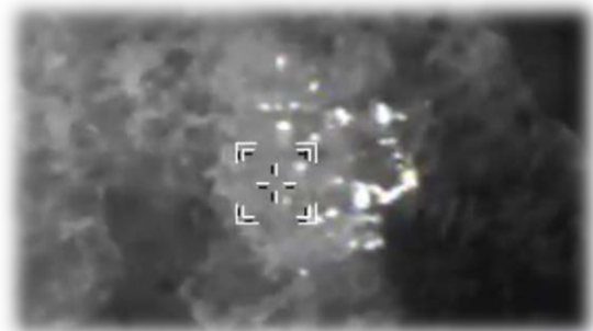
IR image of lightning caused fire in the Aldo Leopold Wilderness

While assigned to the Skid fire, lightning ignited another fire in the wilderness area. The UAS crew was able to fly 10 miles from the ground station, find the fire and relay a size up (location, size, fire behavior, etc.) to fire management personnel. Lessons learned during this activation will be documented and applied to future assignments.