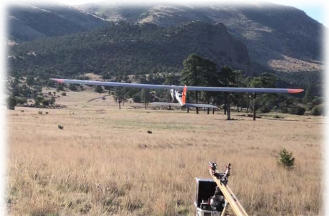
Silent Falcon Takeoff (Gila NF)

Silent Falcon was mobilized on 7/5/19 to the Miller Fire in southern Arizona and reassigned to the Skid Fire in New Mexico on 7/12. This is the first CWN activation of the 2019 fire season. Federal UAS Manager and Data Specialist positions were filled and trainee positions were authorized by the requesting unit. The Miller fire was managed by a Type 2 IMT (Swope). Silent Falcon was utilized for perimeter mapping, infrared detection, and situational awareness. 12 flights were conducted for a total of 9.5 hours of flight time.