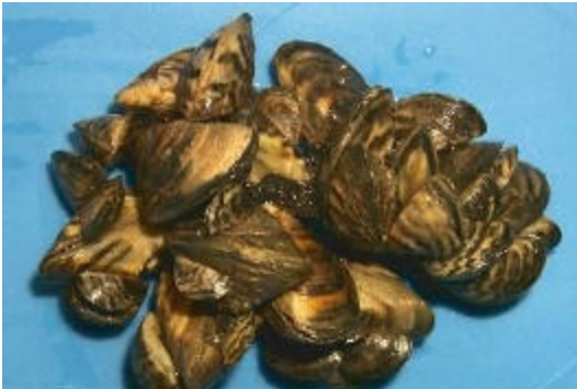
Zebra mussels are moving south and west from the Great Lakes

Invasive species -- whether plants, insects, animals, pathogens or parasites -- cost the U.S. economy over $100 billion per year.