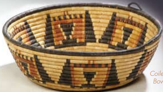
Coiled Basket Bowl, Hopi

You can help protect yourself by becoming familiar with the laws regulating the sale of American Indian arts and crafts in Arizona, and by considering the shopping tips provided in this brochure.