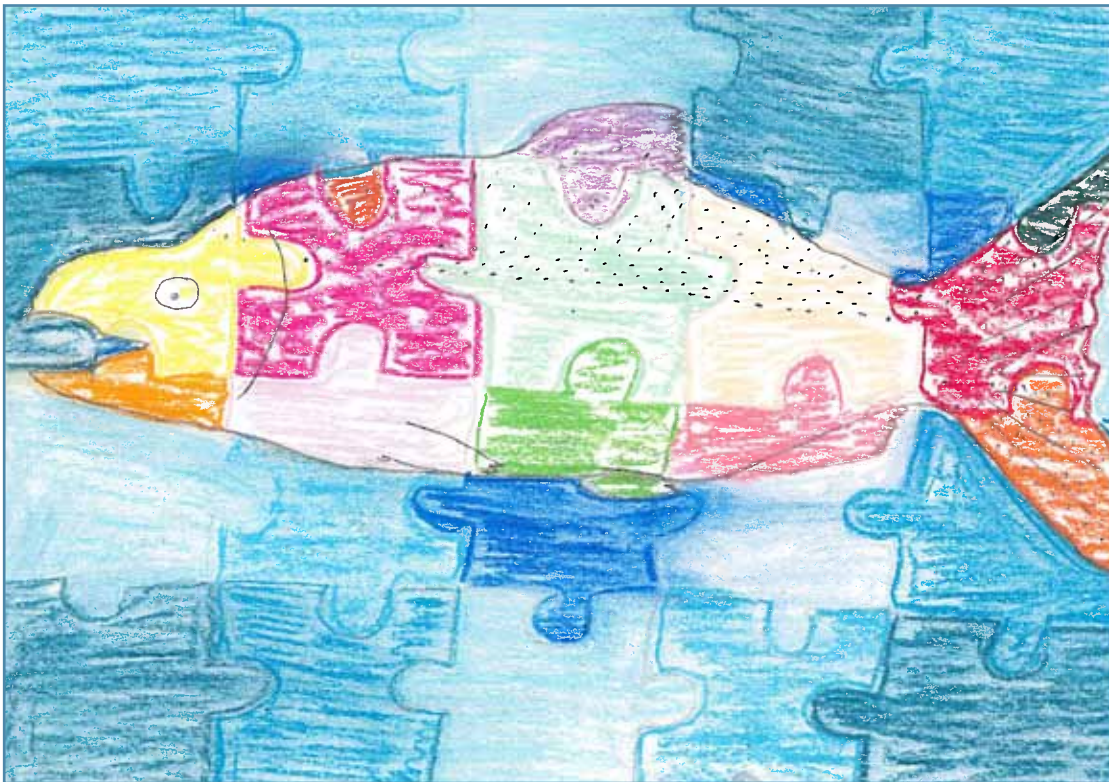
2013 Student Art Contest Honorable Mention: Amanda Norbert, 17, Koliganek