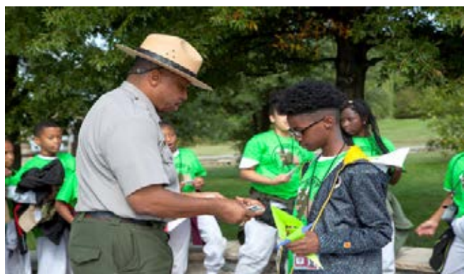
A fourth-grader receives his Junior Ranger badge from a park ranger at Anacostia Park, National Capital Parks-East.

The budget request funds park and program operations that protect and inform visitors and employees and keep NPS resources unimpaired for future generations. Changes in the 2023 budget aid efforts to understand and address the impacts of climate change on NPS resources and expand the inclusion of people of color and other underserved groups.