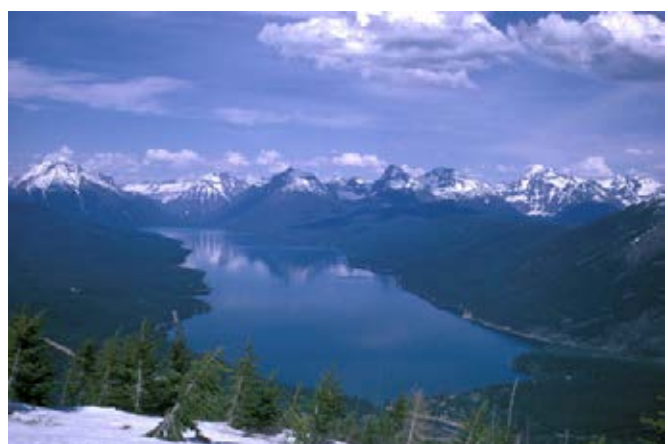
Glacier National Park in Montana.

The budget requests $279.3 million for the NPS Construction program. The budget includes $120.7 million for line-item construction projects to address high-priority needs on mission-critical