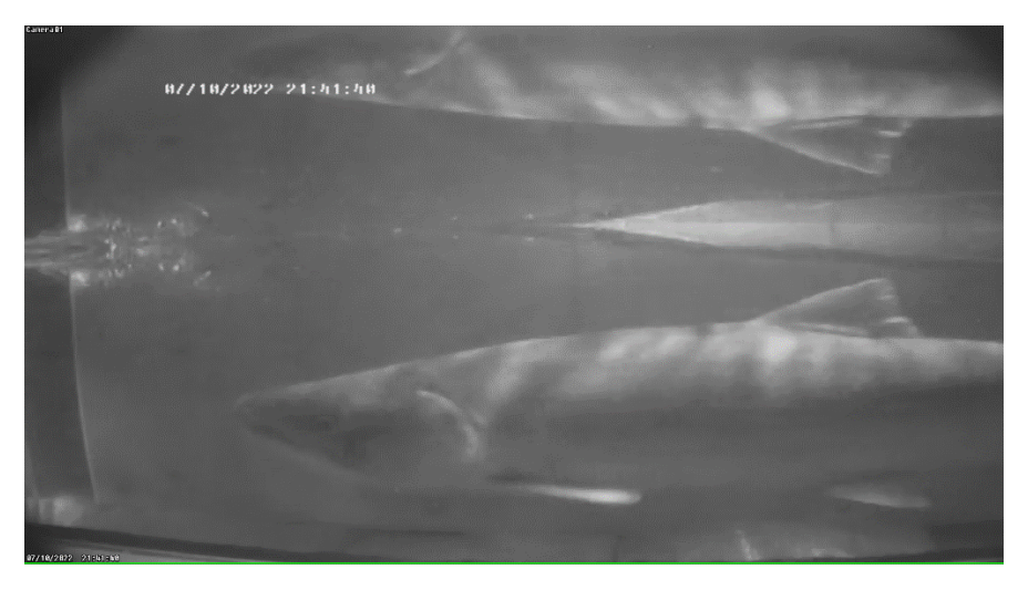
Underwater Image of Sockeye Salmon Passing the Tanada Creek Weir, 2022

The total Copper River District commercial harvest reported by the Alaska Department of fish and Game (ADFG) for the season through August 12 is 591,154 Sockeye Salmon, 11,625 Chinook Salmon, 1,503 Coho Salmon, 59,107 Pink Salmon, and 13,222 Chum Salmon.