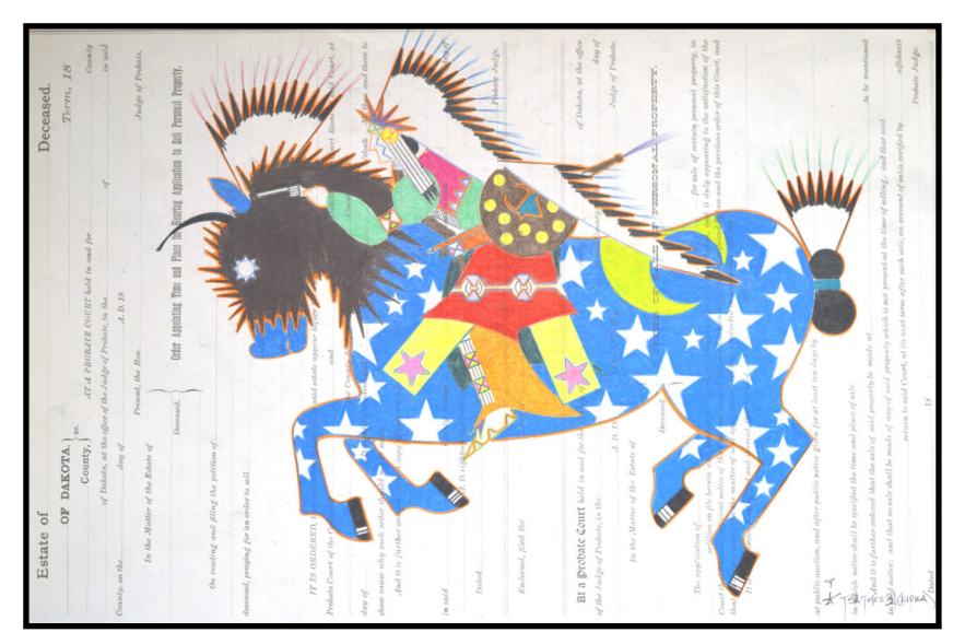
Night Sky Colored pencil on antique ledger paper © 2022 Beau Tsatoke