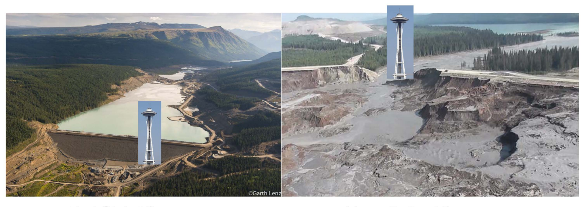
Red Chris Mine Tailings Dam = 341 feet high Space Needle = 605 feet