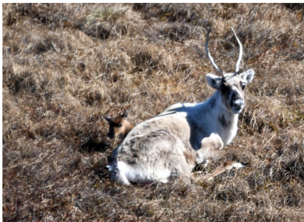
A Western Arctic Herd female and her newborn calf.

Caribou are well-known for returning to calving areas each spring, but why do they use those particular places? Researchers at the National Park Service and University of Alaska - Fairbanks set out to investigate this question for Alaska's largest caribou herd, the Western Arctic Herd, that lives in northwest Alaska. They determined where females delivered their calves using GPS collar data from 2010 through 2017, calculated the calving area for each year, and then compared each calving area to every other year to see how consistent they were. Lastly, they used satellite