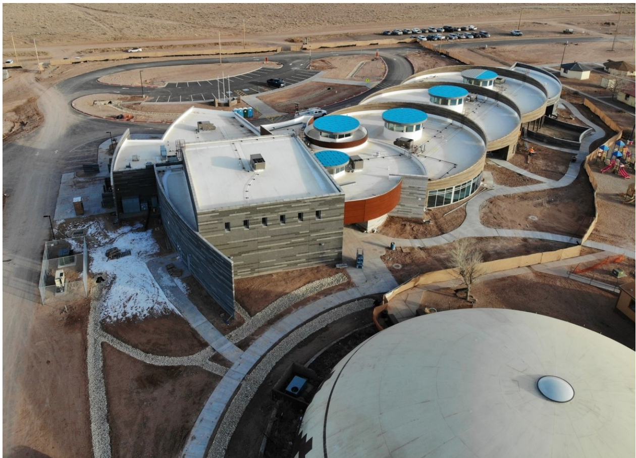
Little Singer Community School in Birdsprings, Arizona

The final schools from the 2004 list under construction are the Beatrice Rafferty School (following construction completion, the school will be renamed Sipayek Elementary School) and Cove Day School. As of January 2020, 8 of the 10 schools from the 2016 school replacement list (Laguna Elementary, Quileute Tribal School, Blackwater Community School, Dzilh-Na-O-Dith-Hle Community School, Lukachukai Community School, Greasewood Springs Community School, T'iis Nazbas Community School, and Chichiltah-Jones Ranch Community School) are funded. Of the funded schools, one school has awarded their Design-Build contract, four schools are in the Design-Build contract process, and three schools are drafting Space Allocation Agreements.