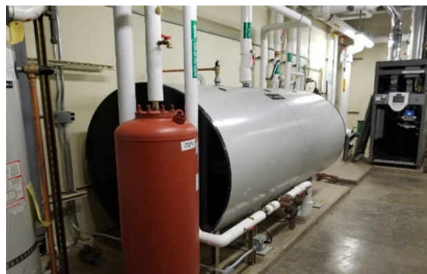
Boiler at Blackfeet Dormitory in Montana

Funds requested in FY 2021 will be used for structural design of buildings requiring seismic retrofitting. This program is in compliance with provisions of Executive Order 12941, Seismic Safety of Existing Federally Owned or Leased Buildings, which requires Federal agencies to assess and enhance the seismic safety of existing buildings that were designed and constructed without adequate seismic design and construction methods.