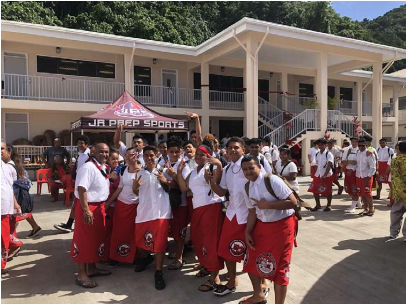
Fagaitua High School, American Samoa

across the office. In 2021, the Department proposes to consolidate all agency ethics staffing and funding within the Departmental Ethics Office in the Office of the Solicitor. The 2021 budget therefore assumes a transfer of $16,000 associated with current office ethics activities. The budget