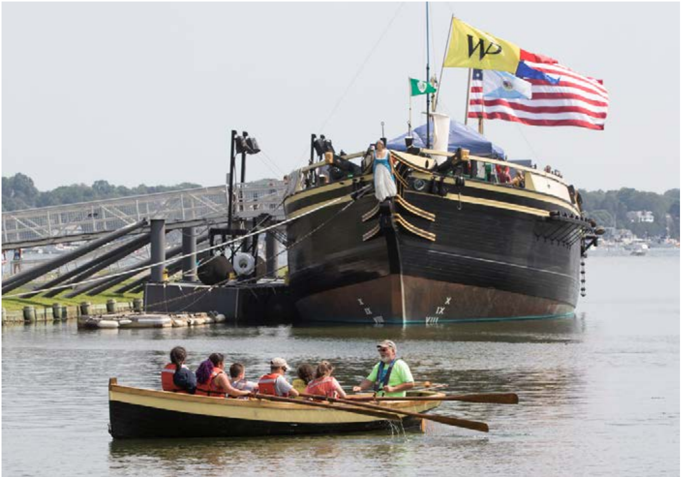
Salem Maritime National Historical Park: After more than 3 years of renovations, the Friendship returned to port in Salem, MA this summer.

supports internal administration needs, such as personnel, finance, procurement, data processing and communications, and other support services. The budget includes $4.6 million, as authorized in the NPS Centennial Act, to support National Park Foundation efforts to promote public-private partnerships that leverage private funding.