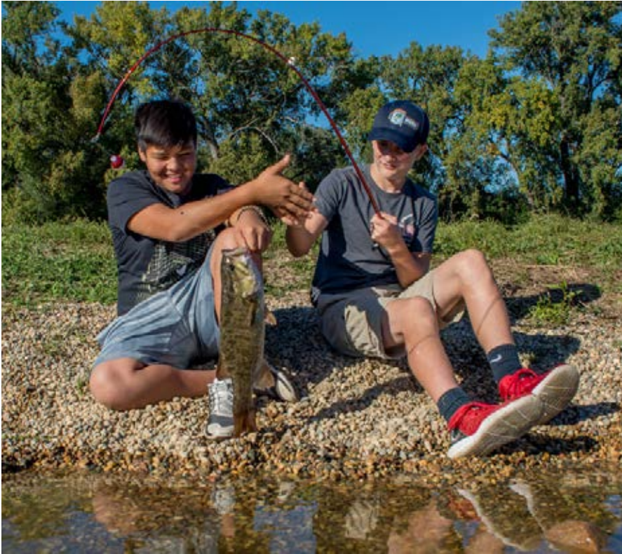
Kids celebrate their catch.

Plan to support regional partnerships—known as joint ventures—of government agencies, nonprofit organizations, corporations, Tribes, and individuals working to conserve habitat for migratory birds across North America. Collectively, these cooperative management activities support more than 2.4 million migratory bird hunters that enjoy more than 15.6 million days afield and generate $2.3 billion in economic activity annually.