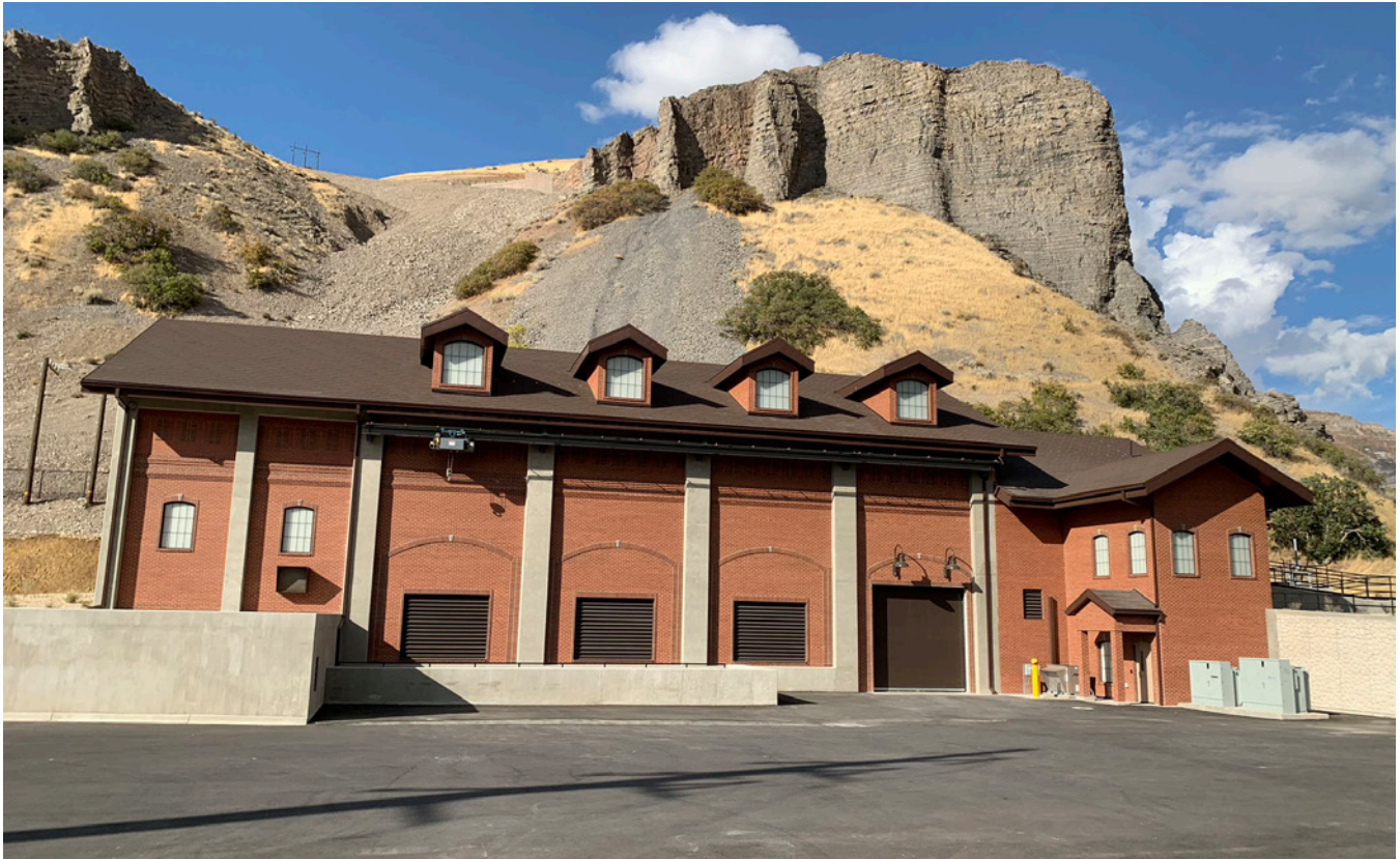
Olmsted Power Plant in Provo, UT

Utah Reclamation Mitigation and Conservation Permanent Account, established by Title IV of the Central Utah Project Completion Act. Those funds will be used as follows: $200,000 for the Diamond Fork ecosystem restoration and maintenance; $6.6 million for the Provo River/Utah Lake Fish and Wildlife program for the recovery of the endangered June sucker; $1.0 million for the Duchesne/Strawberry Rivers Fish and Wildlife program for mitigation of impacts from the Central Utah