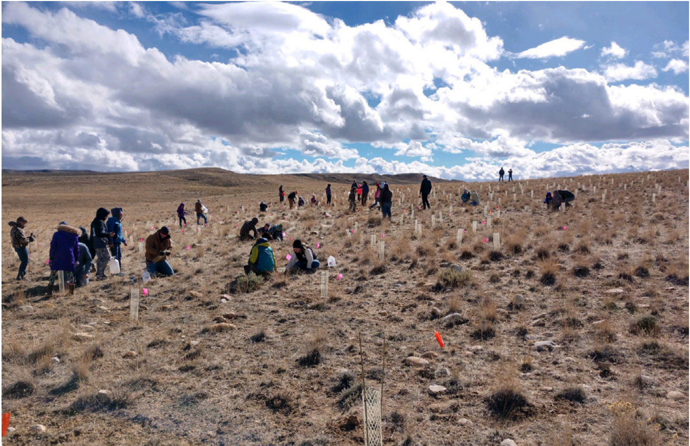
Students join the Wyoming Department of Environmental Quality, BLM, and OSMRE to plant sagebrush seedlings as part of the AML Native Plants Project.