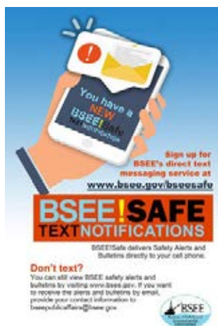
In FY 2019, BSEE launched the BSEE!Safe program to bring critical safety information directly to offshore workers on the Outer Continental Shelf through the use of text messaging notification technology.

Consistent with its 2019–2022 Strategic Plan, BSEE is implementing key management tools focused on strong and smart programs and processes moving forward. BSEE is working to improve and streamline processes; ensure the efficient use of resources within BSEE; enhance development opportunities for the workforce; and integrate effective stakeholder engagement.