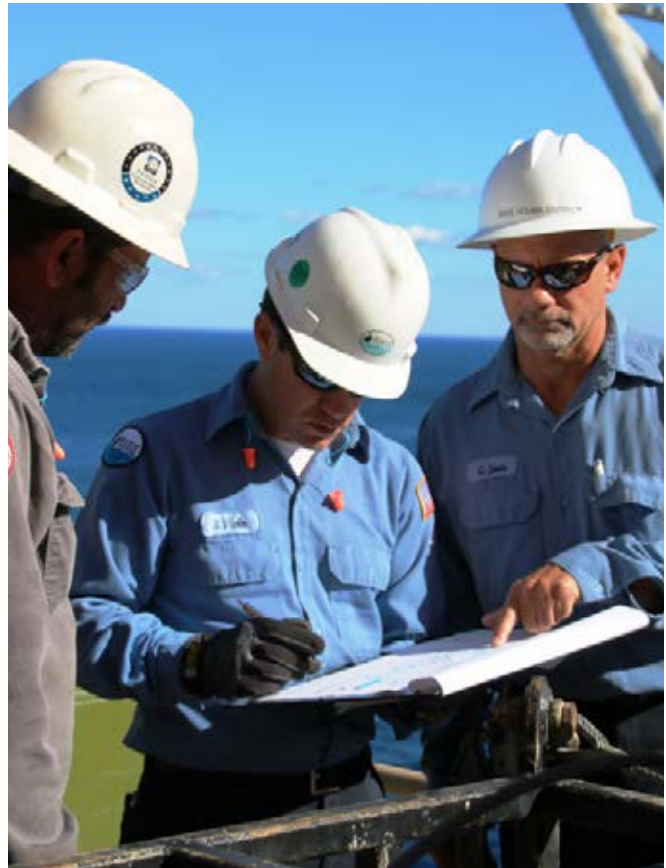
BSEE inspectors play a pivotal role in ensuring that offshore operations are conducted in a safe and environmentally sustainable manner.

Oil Spill Research —This program supports research on the prevention and response to oil pollution, as authorized by the Oil Pollution Act of 1990. The Oil Spill Research program plays a pivotal role by initiating applied research to support decision making on the methods and equipment needed to prevent or mitigate oil spills, a critical component of the offshore permitting process. Funds are used to sponsor testing of new equipment and methods and to support Ohmsett testing and training activities. Located in Leonardo, NJ, the Ohmsett testing facility is the only one of its type in the world, providing full-scale equipment and methodology testing for offshore spills in a safe, controlled environment.