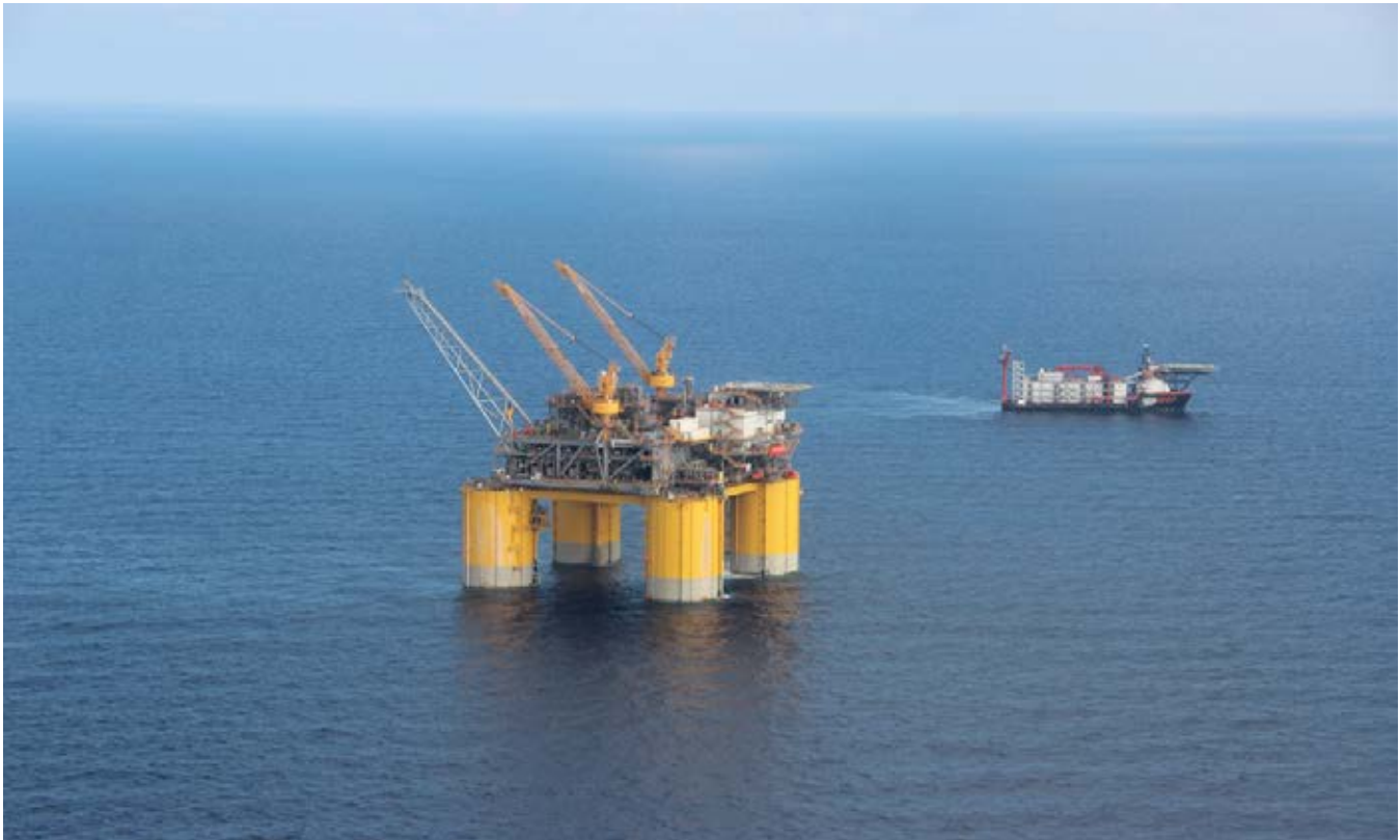
The Hess Stampede, located in the Gulf of Mexico, south of Houma, LA

along the Gulf and Atlantic coasts, with an emerging interest in the Pacific and Alaska regions.