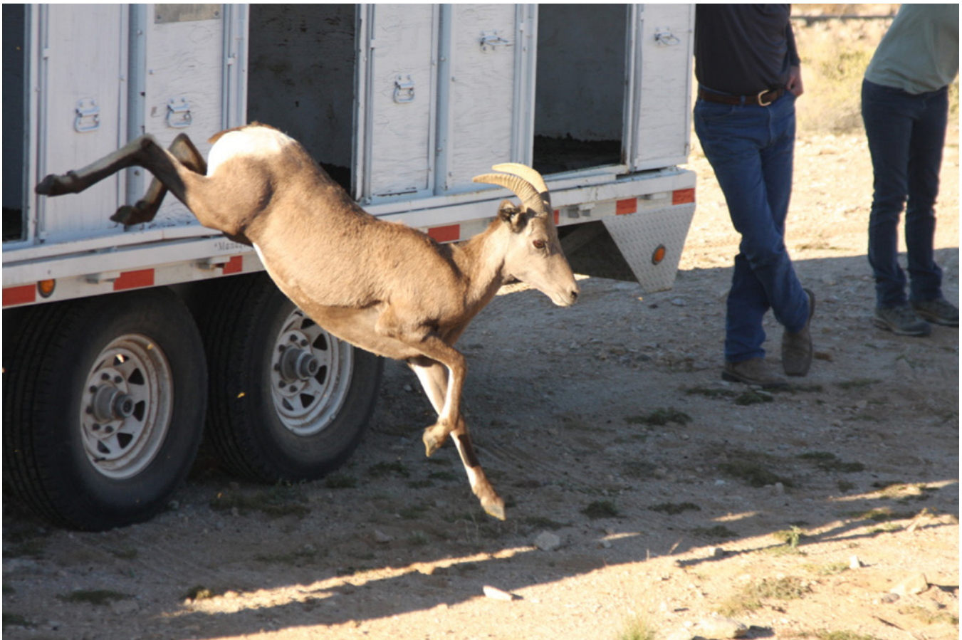
Desert bighorn sheep populations across southeastern Arizona have greatly increased thanks to an ongoing partnership between BLM, the Arizona Game and Fish Department, and the Arizona Desert Bighorn Sheep Society.

Within the Resource Protection and Maintenance activity, the budget proposes $48.1 million for the Resource Management Planning, Assessment, and Monitoring program. The program will emphasize new resource management plans that support Administration priorities, including active land management and creating hazardous fuels breaks;