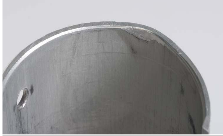
Figure 8. No finish buffing on inside of cover with crack