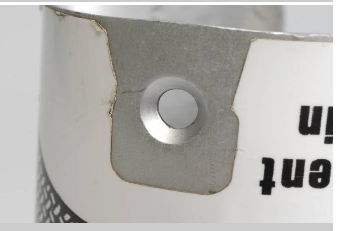
Figure 6: Normal bevel angle