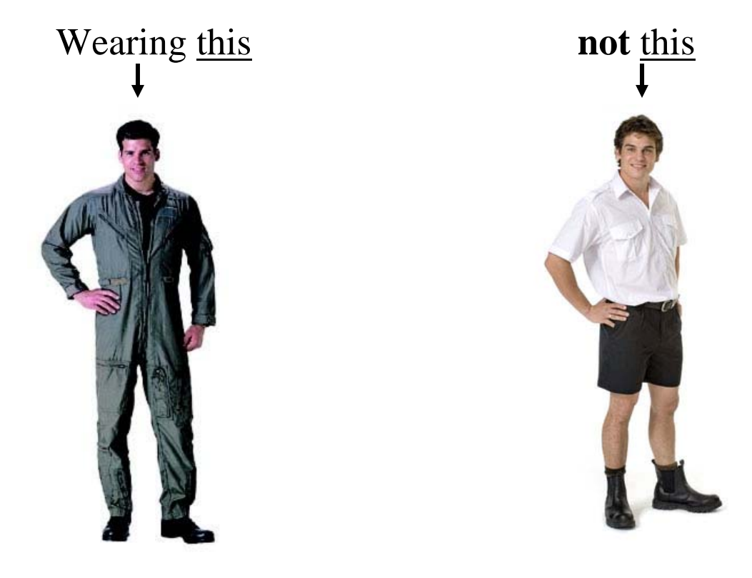
Just may keep this from happening

Subject: Personnel Protective Equipment for ATGS Operations and Fire Reconnaissance Operations