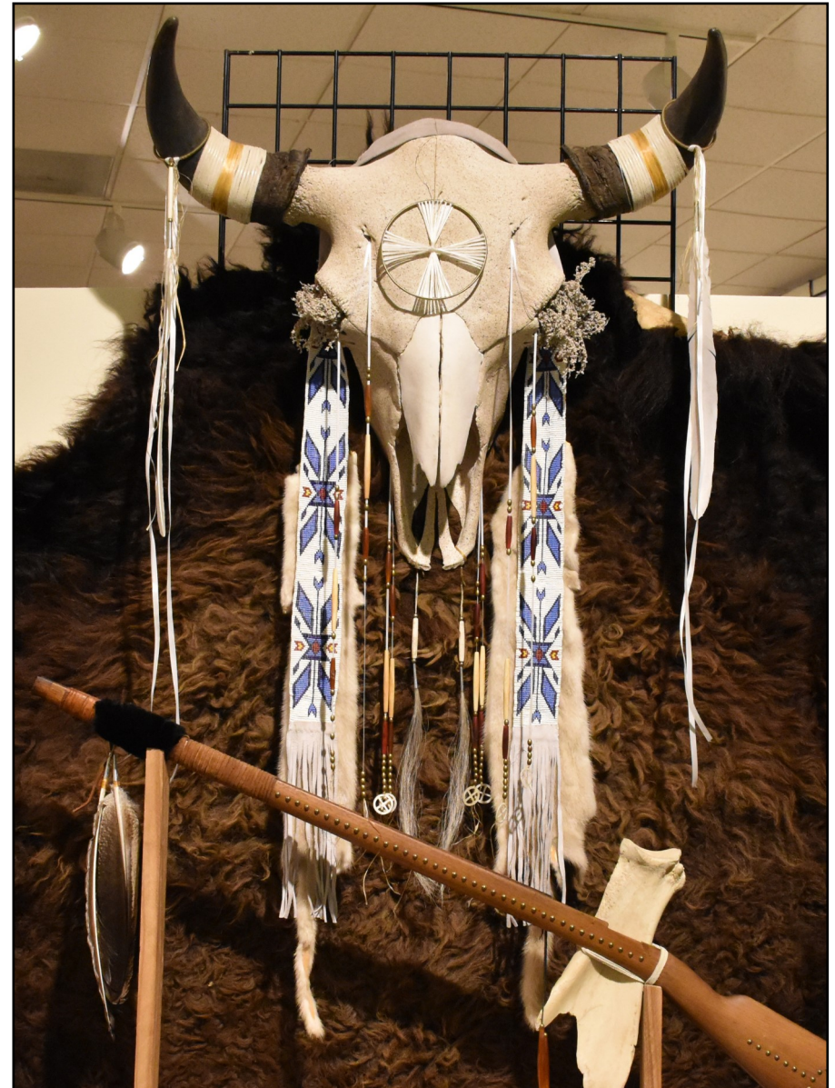
White Buffalo Calf Woman Mixed Media (Foggma) © 2020 Jerry Fogg