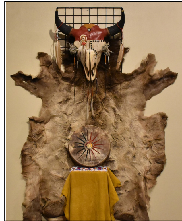
Warriors Mixed Media (Foggma) © 2020 Jerry Fogg