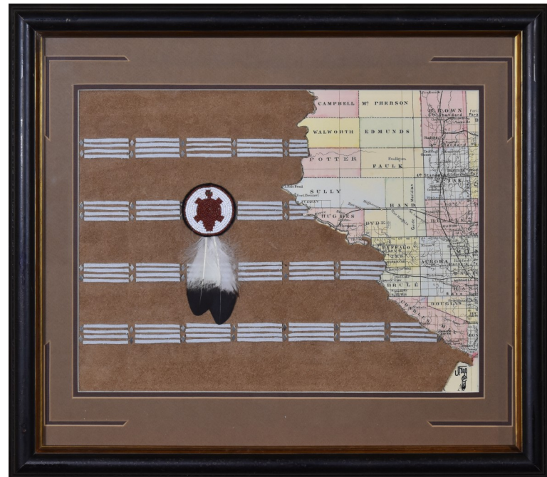
The Great Sioux Nation Mixed Media (Foggma) © 2020 Jerry Fogg