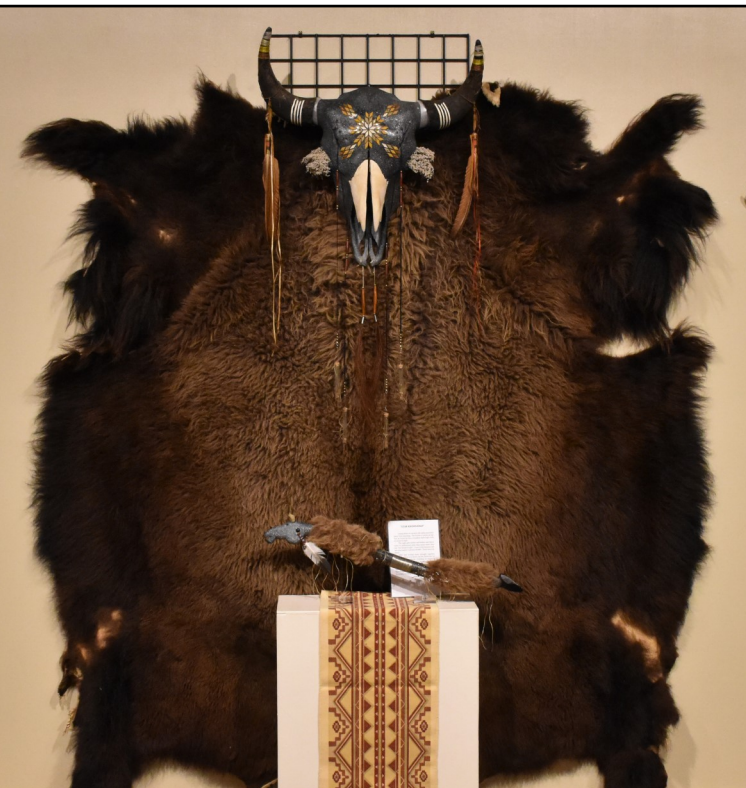
Star Knowledge Mixed Media (Foggma) © 2020 Jerry Fogg