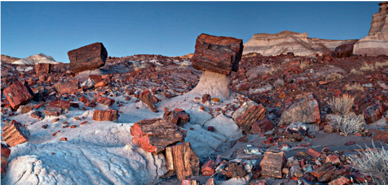
Petrified Forest National Park in Arizona.