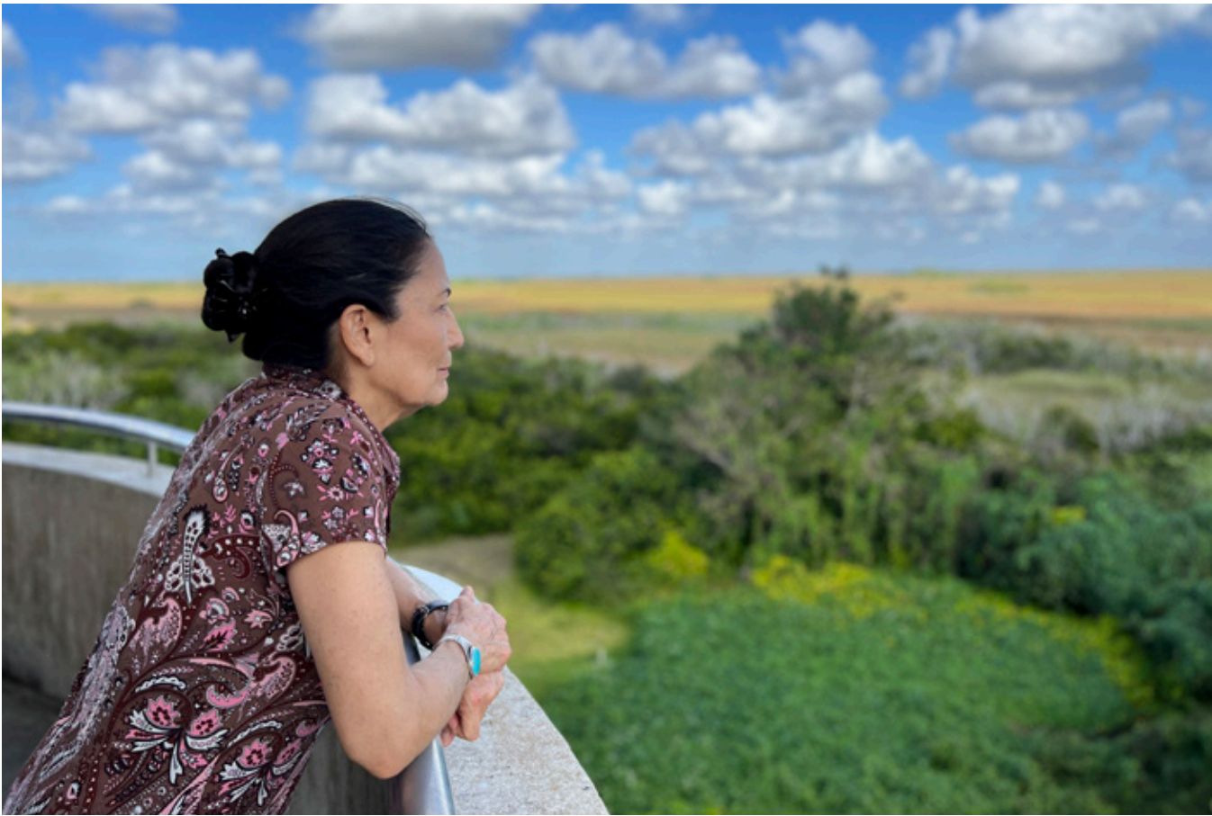
Secretary Deb Haaland visiting Everglades National Park, FL in January, 2023.