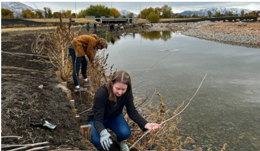
Students plant willows as part of the BIL-funded Provo River Delta Restoration Project.

Funding also supports activities of the Utah Reclamation Mitigation and Conservation Commission, which includes the implementation of the Provo River Delta Restoration Project for the recovery of the June sucker fish, a critical element of listed species recovery efforts. At current funding levels, the Spanish Fork–Santaquin Pipeline, which is under construction, is estimated to be completed in 2025. The Santaquin–Mona Pipeline, the