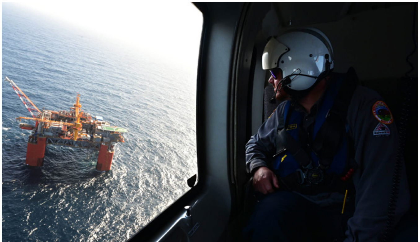
BSEE inspectors play a pivotal role in ensuring that offshore operations are conducted in a safe and environmentally sustainable manner.

Fixed costs of $8.0 million are fully funded.