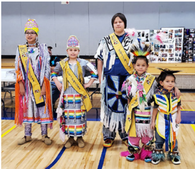
Student Powwow at Fond du Lac Ojibwe School.

The 2024 request includes targeted funding to improve Indian student academic outcomes, address