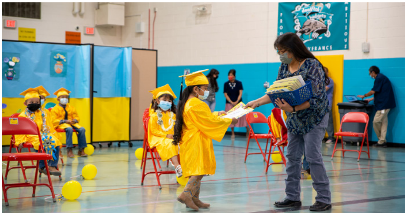
Kindergarten promotion ceremony at Baca /Dlo'ay Azhi Community School within the Navajo Nation.

Fixed costs of $25.6 million are fully funded.