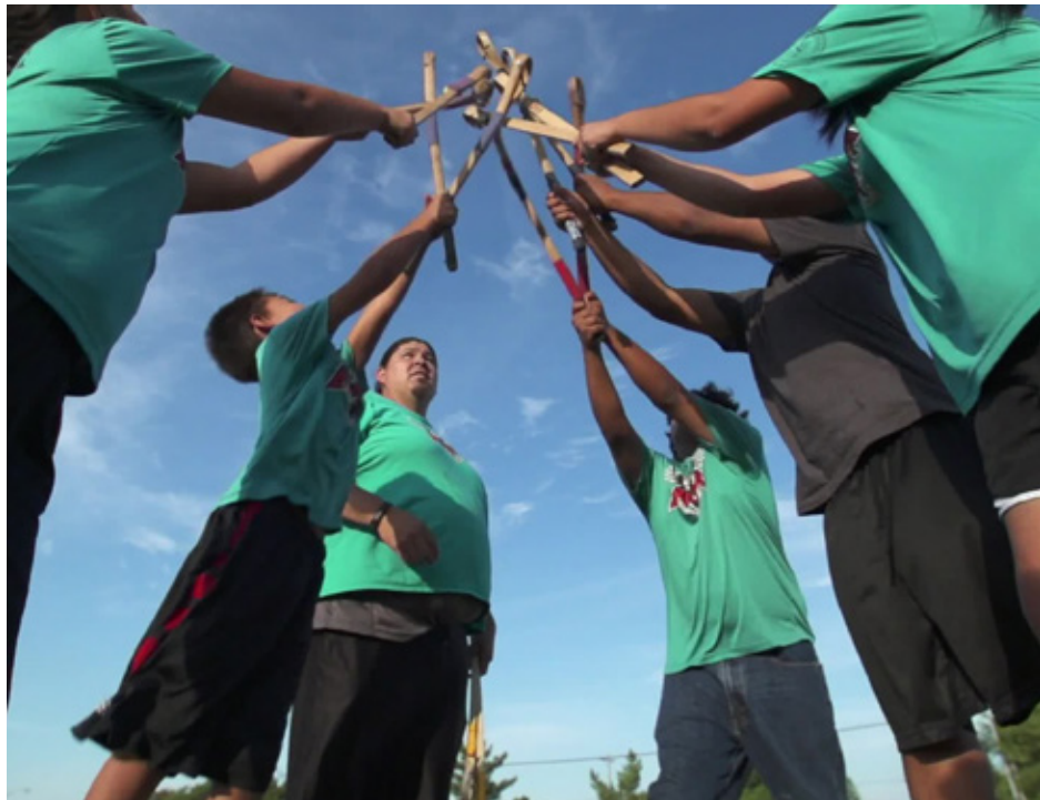
Youth stickball at Chickasaw Children's Village.

The budget proposes $33.7 million, an increase of $5.8 million over the 2023 enacted level, for Education IT to support the ongoing costs of distance learning and enhanced classroom technology. BIE continues to collaborate with Tribes and communities to alleviate ongoing strains imposed by the COVID-19 pandemic on BIE students and their families, teachers, administrators, and other staff members in K–12 schools and at TCUs. The 2024 budget will enable BIE to leverage ongoing infrastructure investments in new technology and operational capabilities at BIE-funded schools, including the new Education Learning Management System, by supporting comprehensive online delivery of educational courses to students and professional development