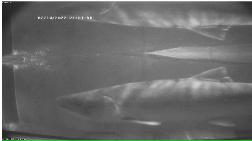
Underwater Image of Sockeye Salmon Passing the Tanada Creek Weir, 2022

The total Copper River District commercial harvest reported by the Alaska Department of fish and Game (ADFG) for the season through August 12 is 591,154 Sockeye Salmon, 11,625 Chinook Salmon, 1,503 Coho Salmon, 59,107 Pink Salmon, and 13,222 Chum Salmon.