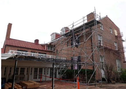
Repairs to Belmont-Paul Women’s Equality National Monument.