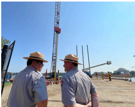
Groundbreaking event for the Tidal Basin seawall restoration project.