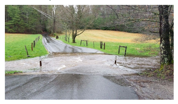
Flooded road at Great Smoky Mountains National Park.

Great Smoky Mountains National Park encompasses over 800 square miles in the Southern Appalachian Mountains and is the most visited national park in the country. However, roadway pavement at the park has potholes, cracks, dips, and poor drainage. This project will repair pavement, replace guardrails, add new road signs, and improve drainage. These repairs will help ensure that park's roads are safe and accessible to all.