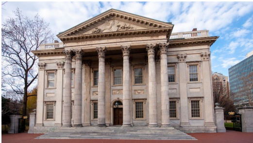
The First Bank of the United States.

The First Bank of the United States, part of Independence National Historic Park in Philadelphia, operated between 1797-1811 after the Federal government adopted Alexander Hamilton’s proposal to establish a national bank, laying the foundation of the U.S.’s financial systems. The bank will undergo an extensive rehabilitation ahead of the 250th anniversary of the Declaration of Independence so it can reopen to the public for the first time since the 1970s. This project work will renovate the building’s interior and exterior by replacing leaking metal roofing, stabilizing, cleaning, and repairing marble and brick masonry, correcting moisture incursion problems, and updating the electrical and HVAC systems.