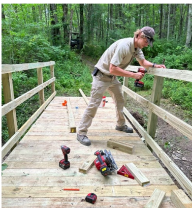
Trail bridge construction in progress at Erie National Wildlife Refuge.

GAOA LRF is funding Maintenance Action Teams (MATs) in the National Park Service and U.S. Fish and Wildlife Service. MATs primarily consist of federal employees who mobilize regionally to work on smaller scope construction, demolition, rehabilitation, or preservation activities. As of September 2023, MATs have completed work Erie National Wildlife Refuge, Cherry Valley National Wildlife Refuge, and Johnstown Flood National Memorial in Pennsylvania.