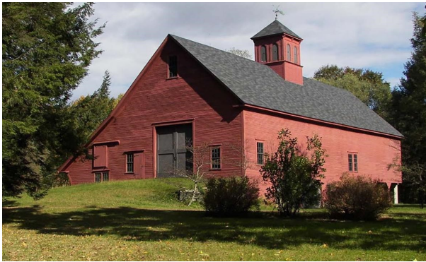
Blow-Me-Down Farm at Saint-Gaudens National Historical Park.

Saint-Gaudens National Historical Park features the home, studios, and gardens of Augustus Saint-Gaudens, one of America’s greatest sculptors. Historic buildings at the site have deteriorated and critical building systems require replacement to protect high value art collection from fire, theft, and damage. This project will replace mission-critical fire and security systems, update electrical infrastructure, replace the HVAC system, and modify facilities to meet accessibility standards. Work also includes rehabilitating historic structures to serve as a center for the arts and support future leasing opportunities. The buildings will be more reliable, resilient, and energy efficient, providing safe and comfortable facilities for staff and visitors.