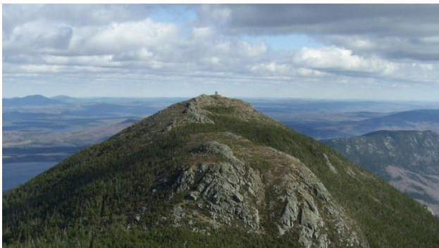
The Appalachian National Scenic Trail.

The Appalachian National Scenic Trail is a 2,190+ mile long public footpath that traverses the scenic, wooded, pastoral, wild, and culturally resonant lands of the Appalachian Mountains. This project will rehabilitate and repair numerous critical facilities located along the Appalachian National Scenic Trail in five New England states, including New Hampshire. It will include a variety of work activities to correct deficiencies associated with trail-related assets such as trail treads, parking areas, maintained landscapes, trail shelters, bridges, privies, campsites, park boundaries, and water wells. This work will improve visitor safety, water quality, accessibility, and reduce erosion.