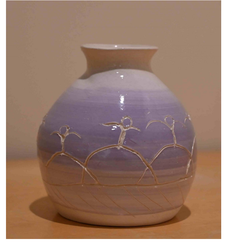
Skydomes