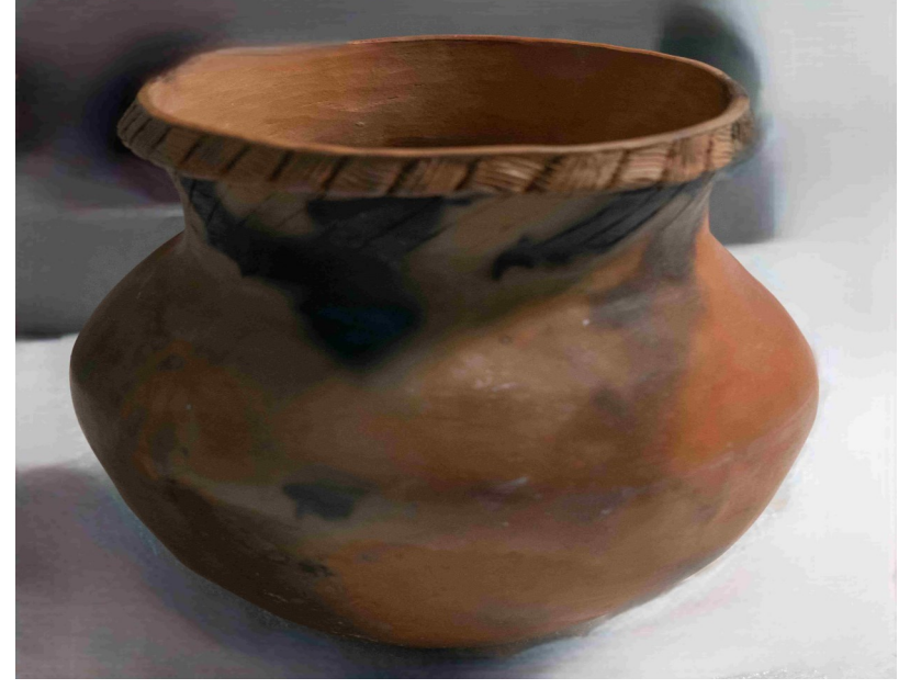
Traditional Oneida Cooking Pot © 2022 Cynthia Thomas