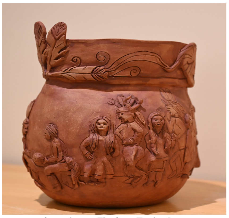
Ostowokowa—The Great Feather Dance