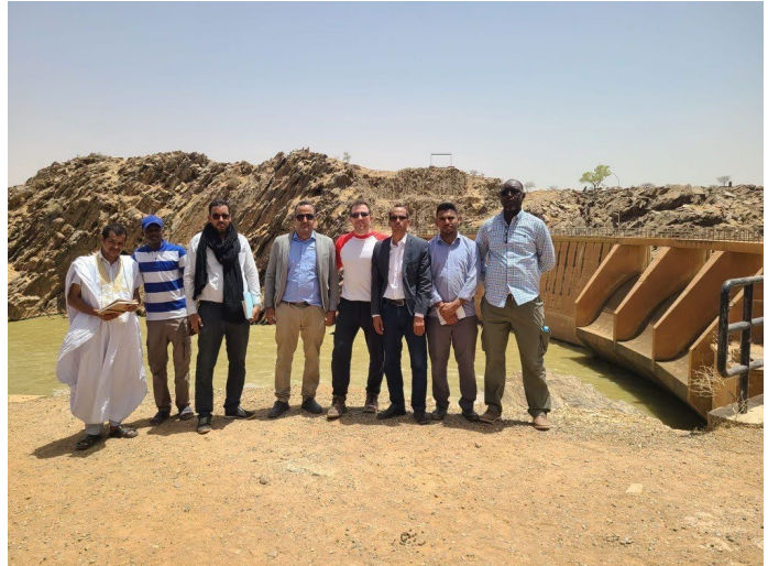
Site visit to Foum Gleita/AWEP Mauritania (April 2024)