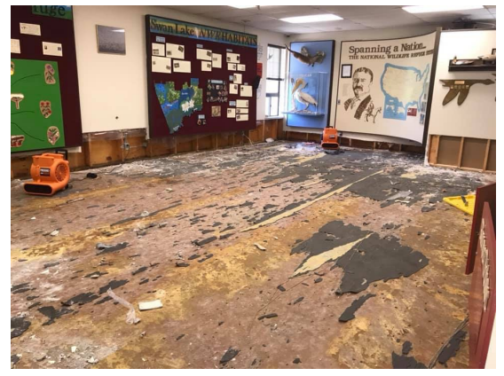
Interior damage cleanup in progress at Swan Lake National Wildlife Refuge.

Swan Lake National Wildlife Refuge is designated an Important Bird Area for Missouri and provides habitat, sanctuary, and breeding grounds for migratory birds and other wildlife. The headquarters office building at the Refuge was constructed in 1981 and has been uninhabitable since 2019 due to flood damage. This project will demolish the old office building and replace it with a new office building to provide a safe and accessible space for both staff and the public. The new building will improve energy efficiency, lower operating costs, and be relocated to prevent future flooding issues. This project will also make necessary repairs to equipment storage buildings, levees, and roads.