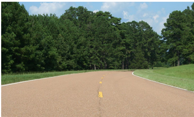
Natchez Trace Parkway.

The Natchez Trace Parkway is a scenic roadway along the “Old Natchez Trace” historic travel corridor that offers present day visitors the opportunity for hiking, bicycling, camping, horseback riding, and fishing. The existing roadway is deteriorating and now presents safety and accessibility issues to drivers. This project will improve up to 50 miles of the Parkway, including public access routes, parking lots, deteriorated pavements, bridges, culverts, audible pavement markings, and safety edges. The project will also improve accessibility and provide a smoother and safer road for motorists and bicyclists.