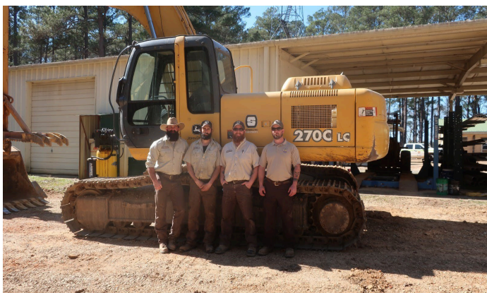
MAT crew at Sam D. Hamilton National Wildlife Refuge.

GAOA LRF is funding Maintenance Action Teams (MATs) in the National Park Service and U.S. Fish and Wildlife Service. MATs primarily consist of federal employees who mobilize regionally to work on smaller scope construction, demolition, rehabilitation, or preservation activities. As of September 2023, MATs have completed work at Sam D. Hamilton National Wildlife Refuge and Vicksburg National Military Park in Mississippi.