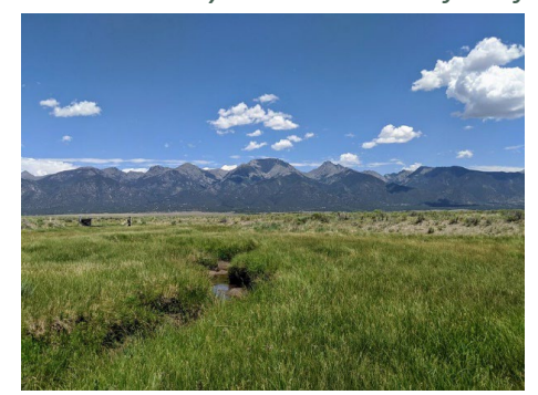
San Luis National Wildlife Refuge.

San Luis Valley National Wildlife Refuge Complex