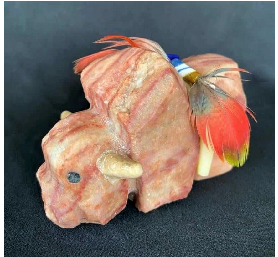
Spring Bull Bison fetish made from Utah alabaster, adorned with parrot feathers, trade beads and turquoise.