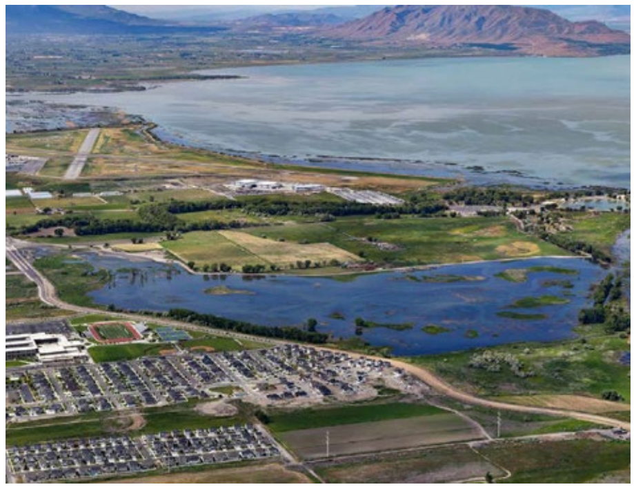
Aerial view of the Provo River Delta Restoration Project after reconnecting Provo River to the Delta.