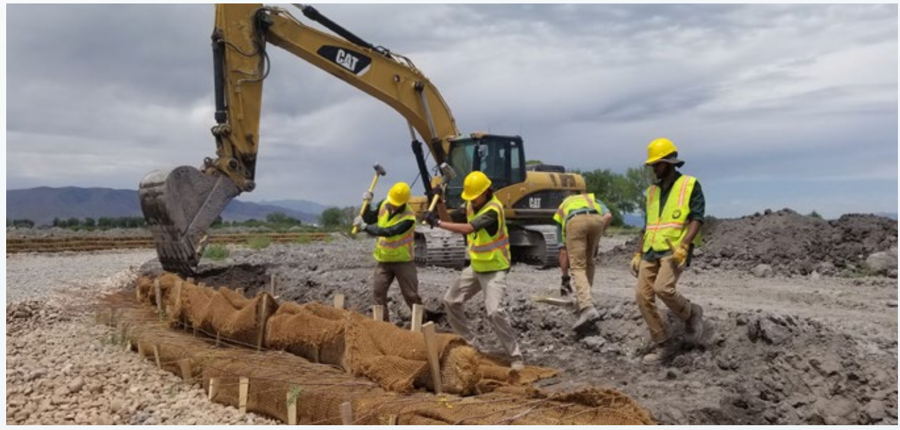
Stream bank construction on the Provo River Delta.

The BIL also provided $40 million to expedite the completion of the Utah Lake System pipeline and delivery of municipal and industrial water to Salt Lake and Utah Counties. The Spanish Fork–Santaquin section of the pipeline is scheduled to be completed in 2026.