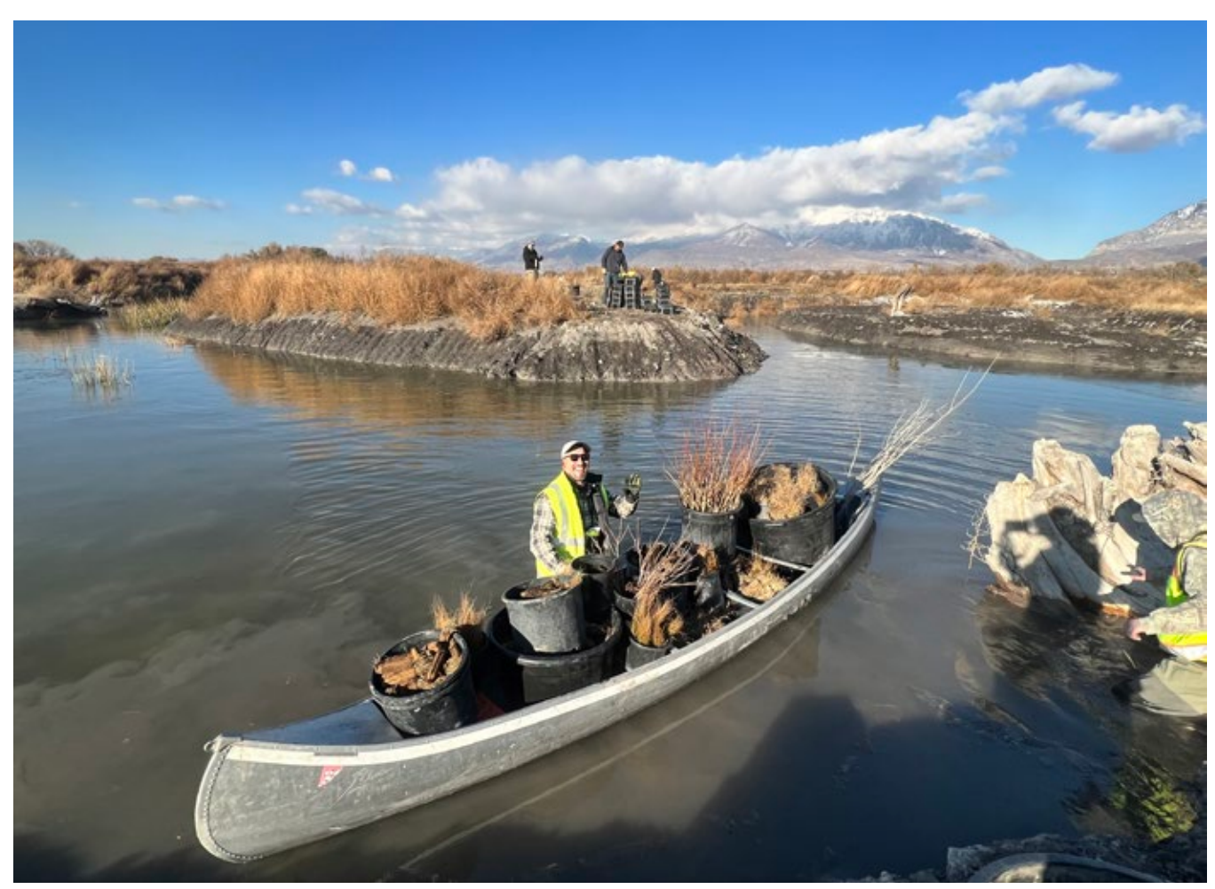
Plantings for the Provo River Delta Restoration Project.

to be completed in 2026. The Santaquin–Mona Pipeline, the next and last pipeline, is estimated to be completed by 2030. The Department's commitments in water conservation, water recycling, and groundwater recharge will continue after the Utah Lake System pipelines are complete.