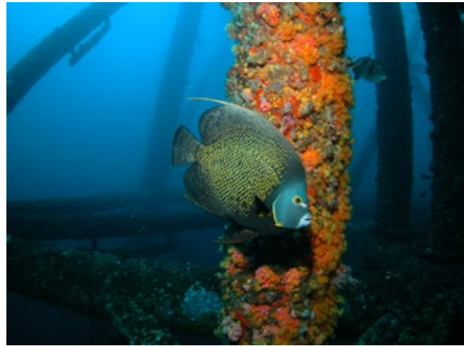
Tropical fish use offshore infrastructure to find food and shelter.

Fixed costs of $5.6 million are fully funded. The request also includes $8.1 million for baseline capacity, which reflects the incremental amount needed to cover the fixed costs associated with mission operations in 2024. This request in combination with the 2025 fixed costs will allow BSEE to meet must-pay requirements without affecting program activities.