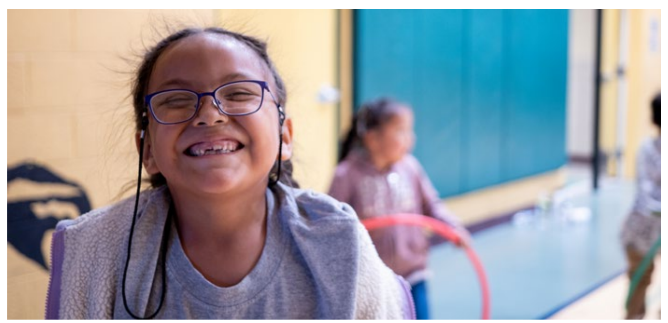
A student stops and smiles during a physical education class at T'iis Nazbas Community School in Teec Nos Pos, AZ.

Targeted funding is included in the 2025 request to improve Native American student academic outcomes, address maintenance needs, support early childhood education and Native language programs, and provide pay parity for Tribal teachers while fully funding projected Tribal Grant Support Costs. The budget provides $518.1 million, a $36.5 million increase over the 2024 CR level, for Indian School Equalization Program (ISEP) formula funds to enhance opportunities and outcomes in the classroom, provide improved instructional services, and support increased teacher quality, recruitment, and retention. The ISEP funds serve as the primary funding source for educational programs at BIE-funded schools. The request level of $22.5 million, including a $500,000 program increase, for Education Program Enhancements supports professional development for teachers, advances the quality of in-classroom instruction, and incorporates improved Native language and