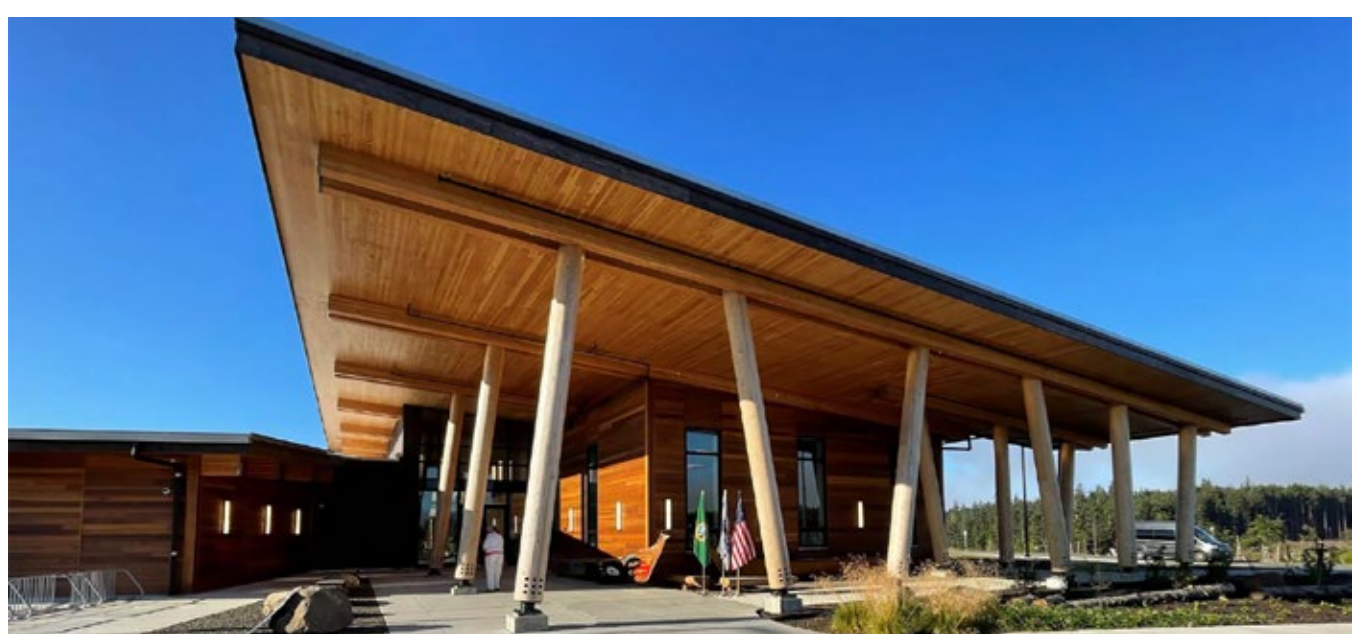
Quileute Tribal School in La Push, WA

Fixed costs of $17.9 million are fully funded. The request also includes $26.2 million for baseline capacity, which reflects the incremental amount needed to cover the fixed costs associated with mission operations in 2024. This request in combination with the 2025 fixed costs will allow BIE to meet must-pay requirements without affecting program activities.