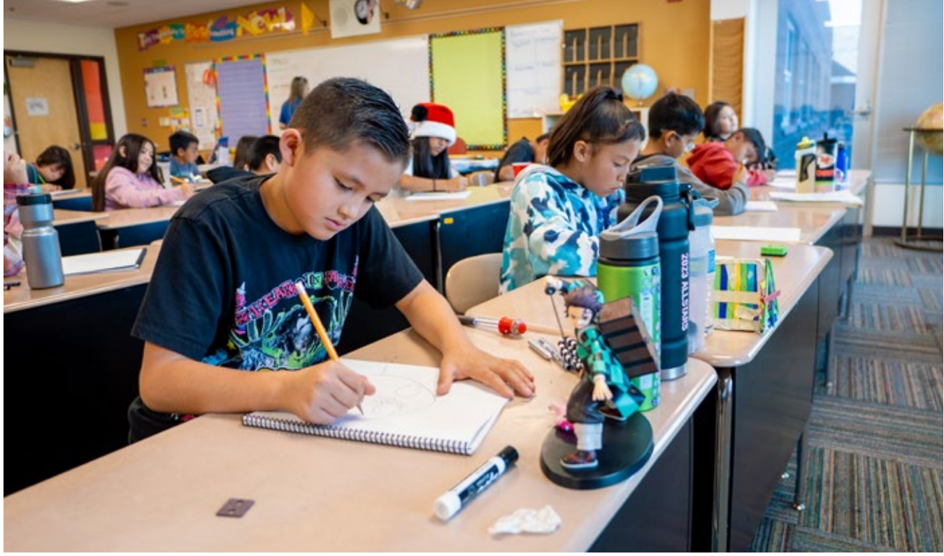
A student studies the water cycle during science class at Isleta Elementary School in Isleta, NM

Tribal Priority Allocations (TPAs) give Tribes the opportunity to further Indian self-determination by establishing their priorities and reallocating Federal funds among programs in this budget category. The 2025 BIE budget includes TPA funding of $67.4 million.