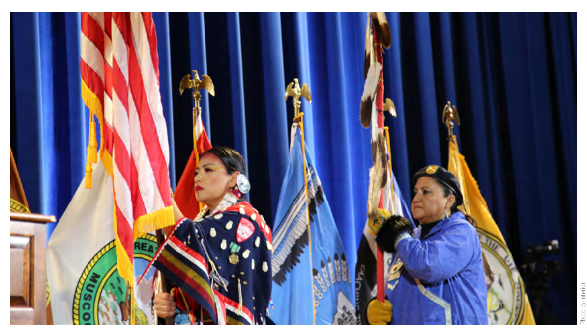
Interior's Native American Heritage Month Event at Washington, D.C. on November 15, 2022.

Interior is the primary federal agency charged with carrying out the United States' trust responsibility to American Indians and Alaska Natives. The OIG, for many years, has identified weaknesses in Bureau of Indian Education school facilities and cited numerous and significant financial management issues at the Bureau of Indian Affairs and the Bureau of Indian Education that leave federally funded programs and operations susceptible to fraud, waste, mismanagement, and abuse which impact Interior's ability to uphold the United States' trust responsibilities and to serve American Indians and Alaska Natives. Interior has committed to improving the relationship between the Federal Government and tribes through regular consultation with tribes, the Secretary's Tribal Advisory Council to inform policy, and transparent engagement. School facilities will continue to be improved as the Department continues to prioritize building safety issues. Interior will continue utilizing the Site Assessment and Capital Investment (SACI) program to assess the conditions of bureau-funded schools, resulting in a long-term facilities plan that is continuously updated and adjustable to changes in funding and criteria. The Department is continuing to invest in remote learning and broadband capabilities. The Department is addressing outcomes related to this management challenge in strategic goal 1.