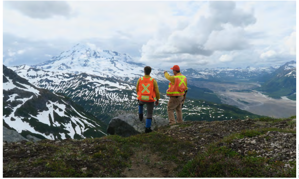
USGS research geologists discuss geology of Lake Clark National Park in Alaska.

Trust and confidence are cornerstones of the Department's unique and expansive mission, which includes a geographically distributed workforce, a vast set of management responsibilities, and diverse stakeholders with varying needs and responsibilities. The American people have entrusted Interior with the sustained use of critical natural resources, the preservation of our most iconic places, and the science to ensure robust decision making, all of which require assurance and fairness at the highest levels.