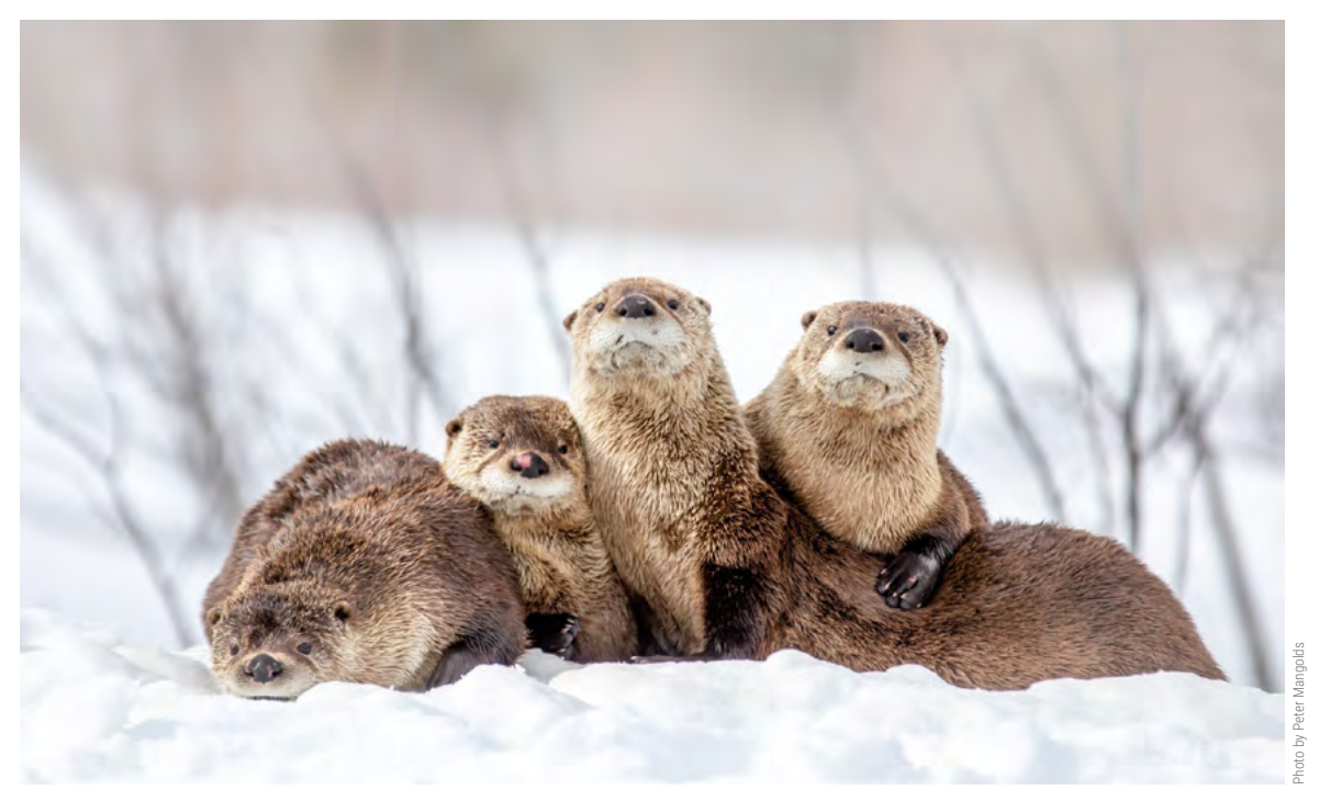
North American river otters in Grand Teton National Park in Wyoming.

Interior is a steward of more than 480 million acres of public lands, accounting for approximately 20 percent of the nation's land mass, over 700 million acres of subsurface minerals, and over 2.5 billion acres of the Outer Continental Shelf. Interior ensures that America's natural endowment, the natural land and water resources of the United States, is managed for the benefit, use, and enjoyment of current and future generations. In the face of climate change and other stressors, the Department uses the best available science, evidence-based natural resource management techniques, technology, engineering, and partnerships and alliances to guide stewardship of public lands and waters.