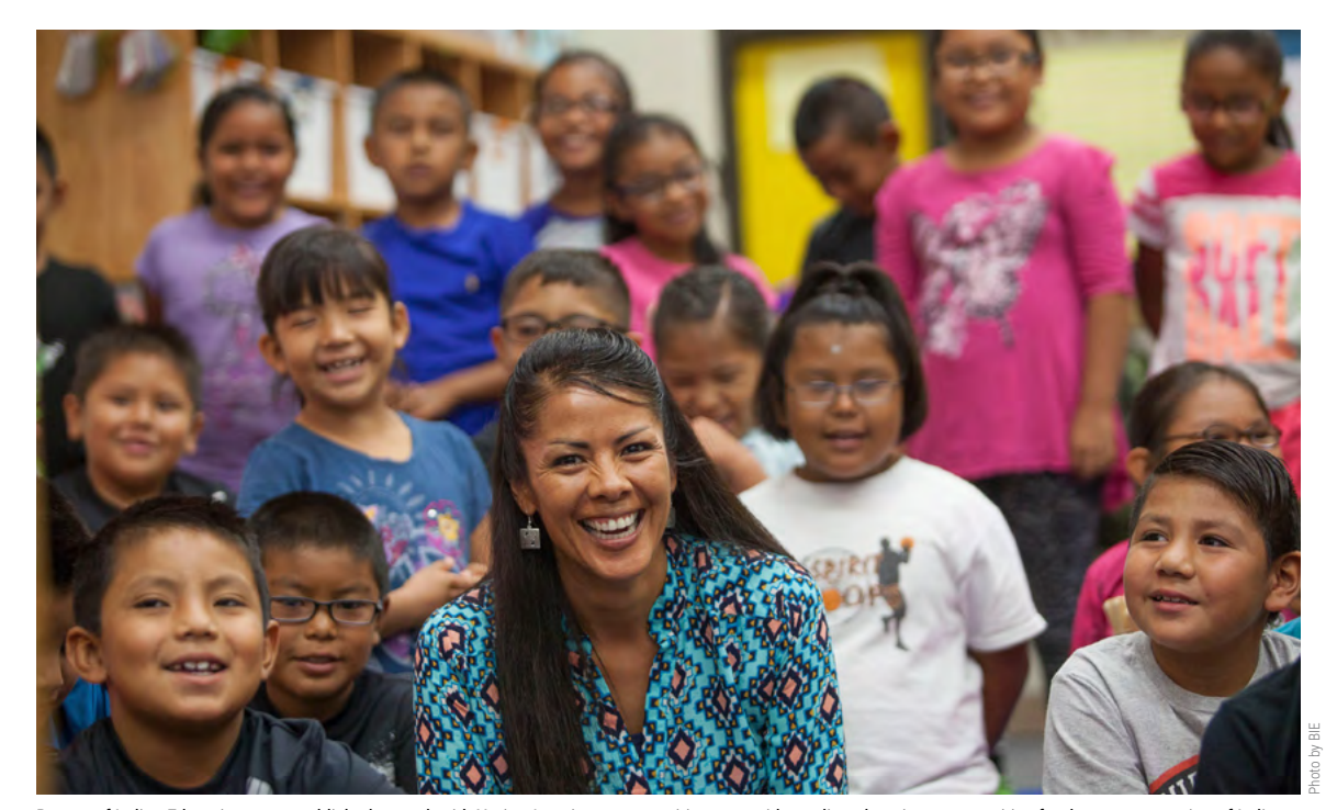
Bureau of Indian Education was established to work with Native American communities to provide quality education opportunities for the next generation of Indian and Alaska Native leaders.

ONE OF THE PRIMARY GOALS of the Department is to promote equity and justice for tribes, American Indians, Alaska Natives, Native Hawaiians, and insular communities. The scope of the Department's responsibilities includes fulfilling fiduciary trust responsibilities, supporting tribal self-governance and self-determination, and strengthening the government-to-government relationship between the Federal Government and tribal nations. Additionally, the Department funds 33 tribal colleges, universities, technical colleges, and post-secondary schools that provide quality education for students to equip them to meet the demands of the future. The Department also provides technical assistance through partnerships with Native Hawaiian and insular communities to efficiently and effectively secure and manage federal funds through planning and program activities.