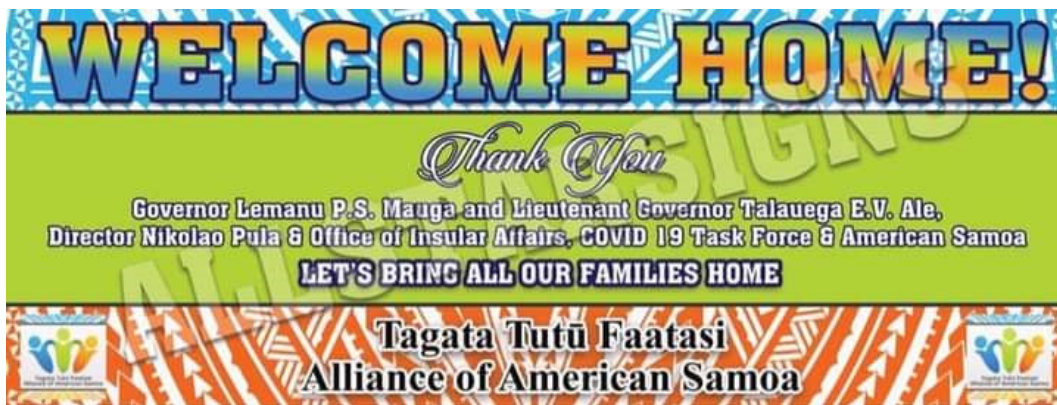
Banner displayed in the territory celebrating repatriation of the first 159 individuals.

The American Samoa Government maintains that its number one priority is to protect the territory from COVID-19 but hopes to be able to bring more residents home as soon as possible. A standing emergency declaration for the territory makes wearing a mask mandatory in public places, encourages the practice of social distancing, and encourages residents of the territory to take the COVID-19 vaccine.