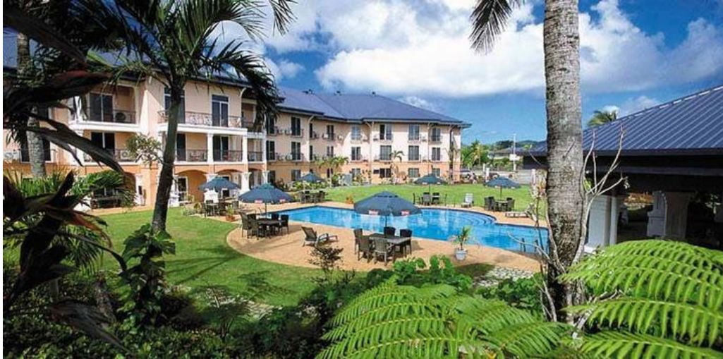
The Tradewinds Hotel in American Samoa where repatriated individuals were quarantined for 10 days prior to being released.

The American Samoa Government maintains that its number one priority is to protect the territory from COVID-19 but hopes to be able to bring more residents home as soon as possible. A standing emergency declaration for the territory makes wearing a mask mandatory in public places, encourages the practice of social distancing, and encourages residents of the territory to take the COVID-19 vaccine.