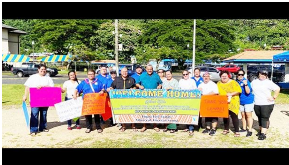
Governor Lemanu and other officials hold up welcome signs for the first 159 individuals to be repatriated back to American Samoa after being stranded outside the territory since March 22, 2020, due to COVID-19-imposed travel restrictions.

American Samoa remains the sole U.S. jurisdiction without any reported cases of the coronavirus (COVID-19). When the World Health Organization declared a global COVID-19 pandemic on March 11, 2020, the American Samoa Government moved to declare a state of emergency in the territory and since March 22, 2020, has restricted air travel in or out of the territory to protect its population. Nearly a year later, hundreds of American Samoans were stranded outside of the territory and remain overseas.