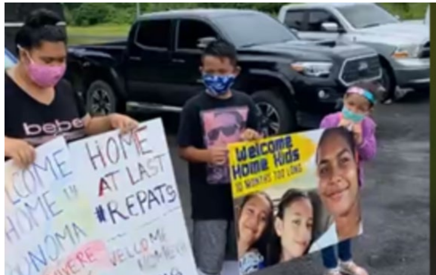
An emotional reunification for families in American Samoa on February 15, 2021, after the successful completion of the first repatriation trip organized by the American Samoa Government.

An initial group of 159 American Samoans was repatriated to American Samoa on February 5 and as of February 15 concluded quarantine protocols, tested negative for COVID-19, and were reunited to their families in the territory.