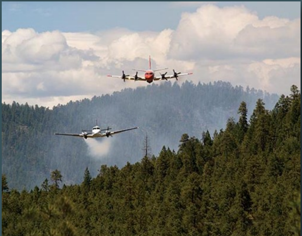
ASM Lead Plane