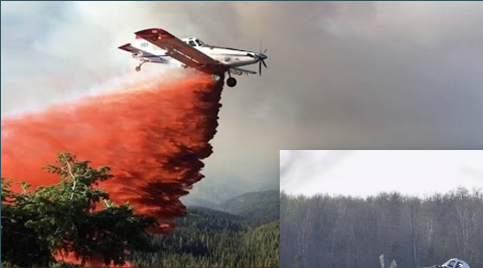
Single Engine Air Tanker (SEAT)