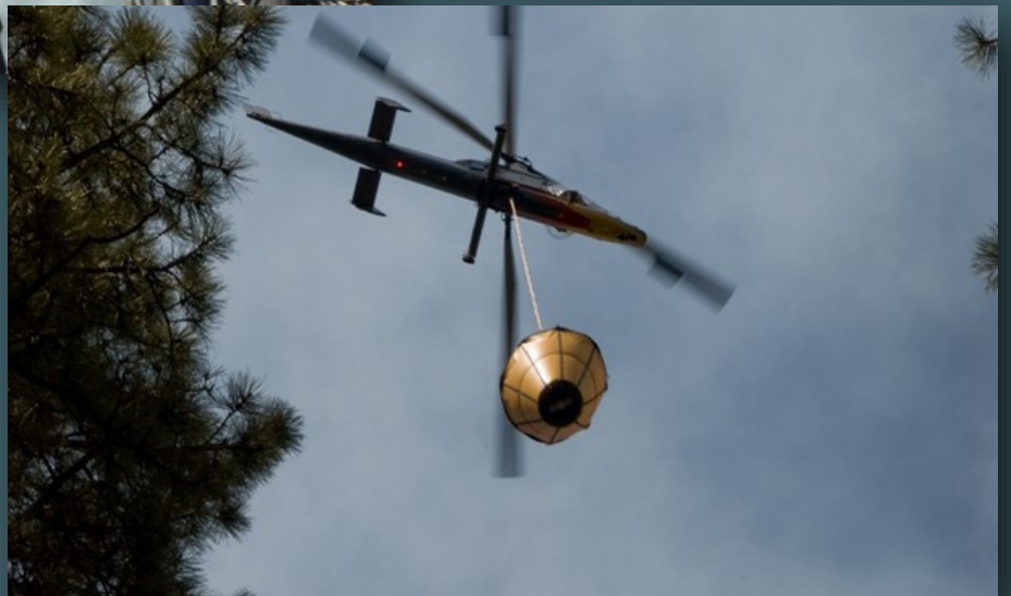
K-Max w/water bucket