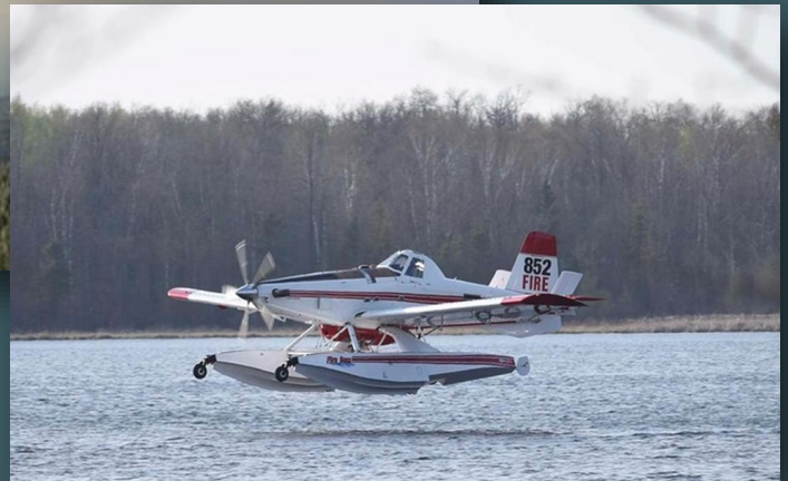
Amphibious Scooper Air Tanker