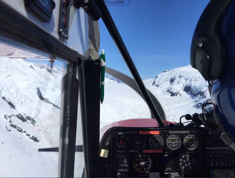
Final approach to landing