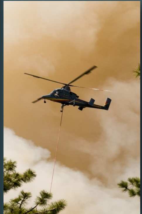
K-Max in heavy smoke