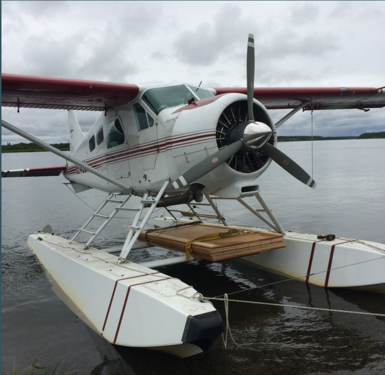
Alaska external load operations