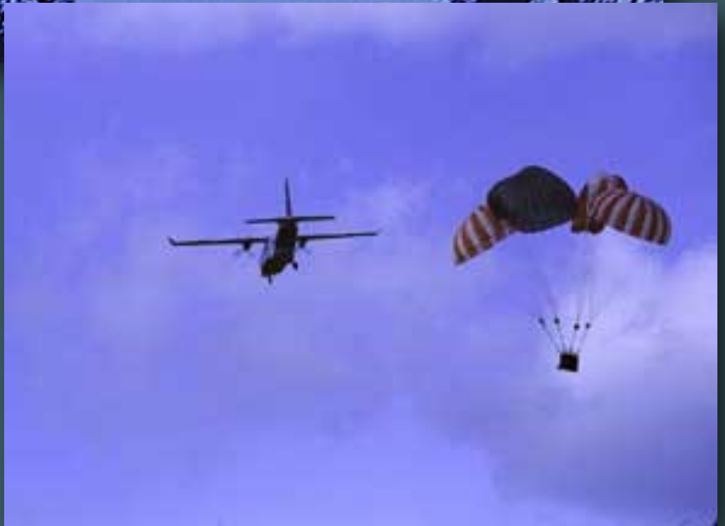
Paracargo missions for deploying firefighting equipment