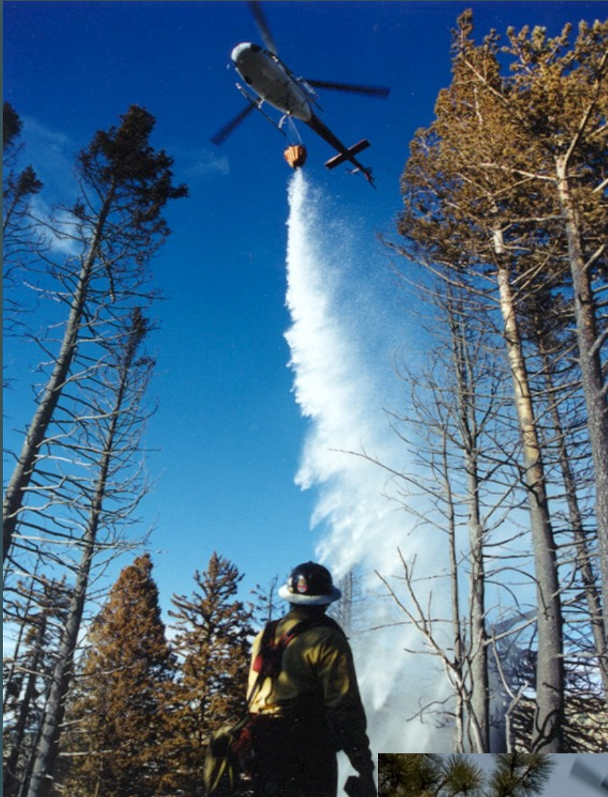
A-Star water bucket drop