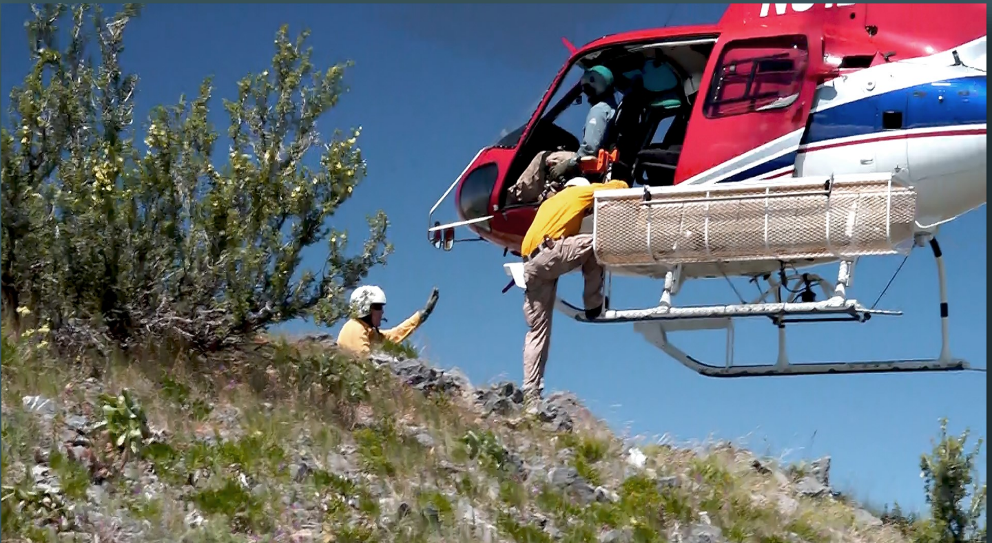
Hover entry/exit procedure