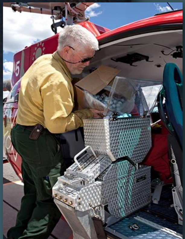
Plastic Sphere Dispenser (Aerial ignition device)