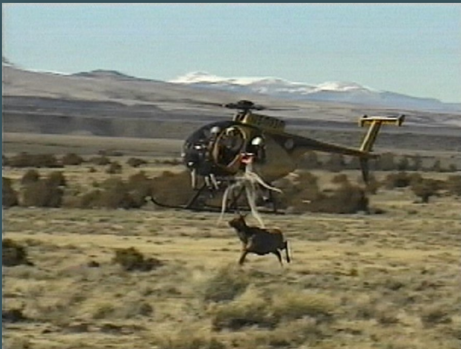
Net gun capture operations