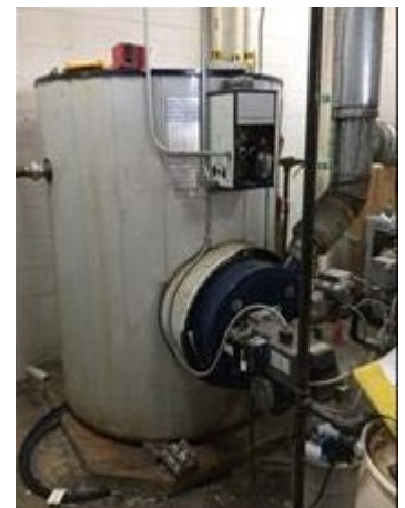
Boiler at Blackfeet Dormitory in Montana

The National Board Inspection Code (NBIC), first published in 1945 as a guide for chief inspectors, has become an internationally recognized standard, adopted by most US and Canadian jurisdictions. The NBIC provides standards for the installation, inspection, and repair and/or alteration of boilers, pressure vessels, and pressure relief devices. IA and DFMC have adopted the NBIC as well as other related national codes as part of its Boiler and Pressure Vessel Policy.