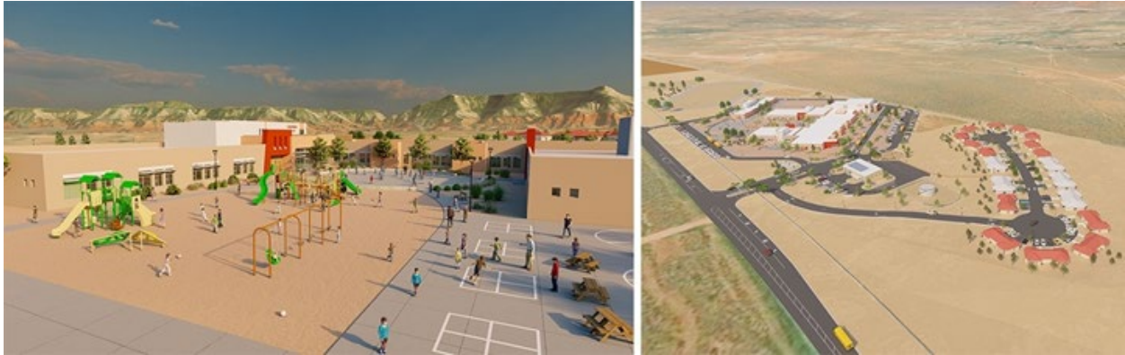
Lukachukai Community School (Conceptual Rendering)

current SA-CI program information can be found on the DFMC website: https://www.bia.gov/as-ia/ofpsm/dfmc/ecsap .